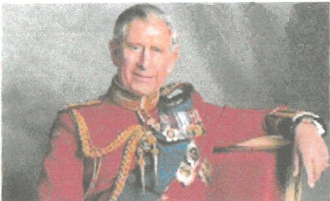
Her son then became King Charles III. God Save the King.