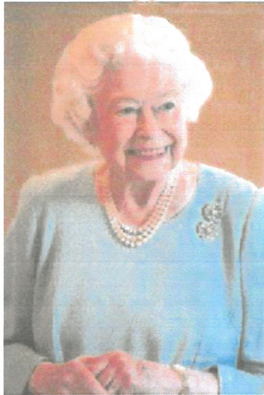
Sadly our Queen who reigned for seventy years, died on September 8th